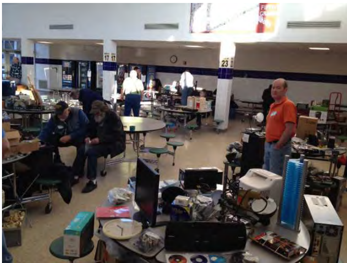
Another shot of the recent Marlboro Fleamarket.