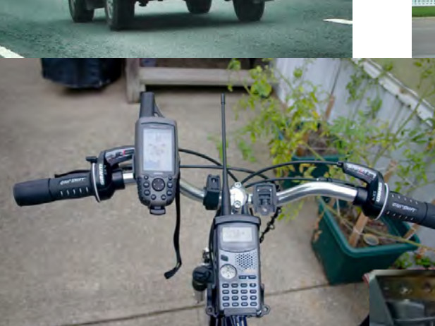
Top left Submitted by Jon (K1TP) Top right I think that might be stans car Below left reminded me of gardies bike To the left : portable operation Bottom left: just funny