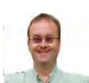
Information desk Dean KB1PGH